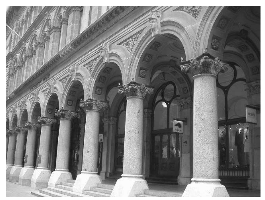
Columns of GPO, Louttit Quarry granite.

the line of entrance steps to the building, the contrast of the light grey granite with the warmer tint of the main walls of the edifice (of the very best Pyrmont stone) being extremely pleasing. Towards George Street a number of the square piers of Pyrmont stone moulded with rusticated work are already built, and give some notion of the grandeur of the proposed building. On one of the granite bases facing the New-street on of the Moruya granite columns (beautifully polished by machinery at work night and day on the premises) was erected on the 21^{st} instant, the day of the arrival here of H.R.H. the Duke of Edinburgh last year. The first piece of polished granite ever produced in the colony is of exceeding beauty. It will be one of ten columns, supporting a lofty arcade, which is to reach from George Street half way down to Pitt Street – the limit of the present contract.