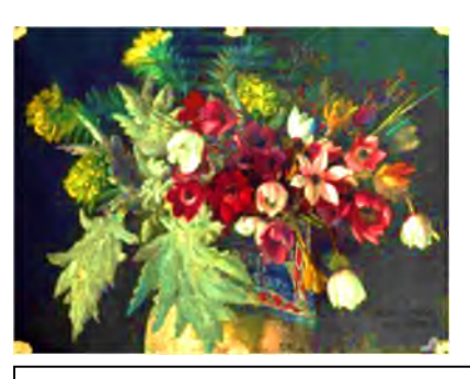
Gallipoli Wildflowers by George Lambert. 1919.

Among the sea dunes white lilies grow, and they, too, will have power to win us memories of Palestine, unclouded by sorrow; memories of the blue Mediterranean, serene as a summer sky, or flinging ramparts of foam alongshore.