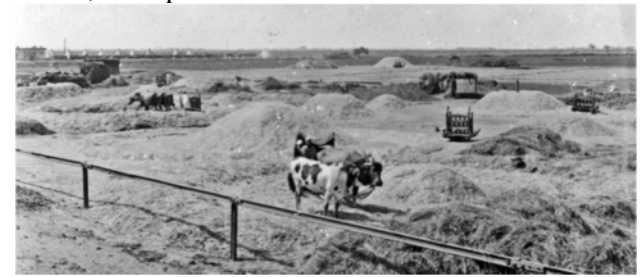
AWM B01328 Harvesting Tibben on the Nile Delta

Tibben refered to in the Waler's feed is finely cut straw made from various crops – wheat, barley, lentils, chickpea.